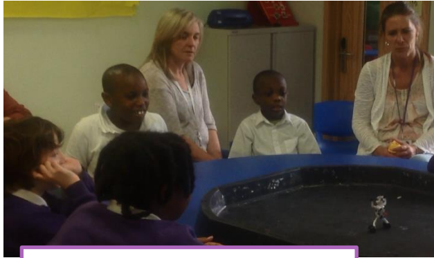
Everyone is attending to the same thing