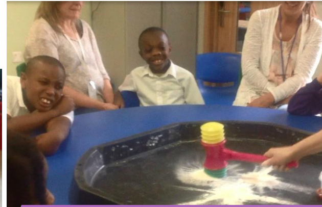
Tiras and Ibs anticipating what will happen next